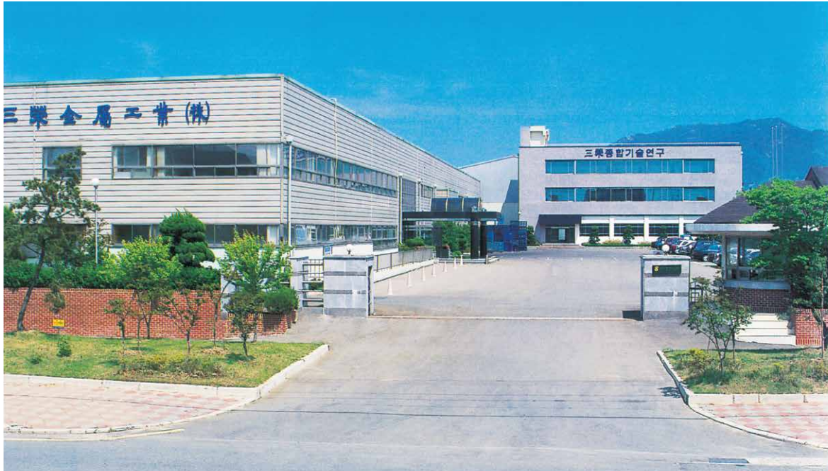
Main plant 본사 공장