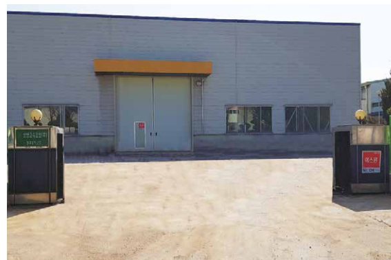
3rd Factory(Near SEOUL)