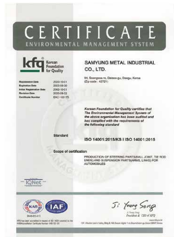
[ISO 14001 환경경영시스템 인증서]