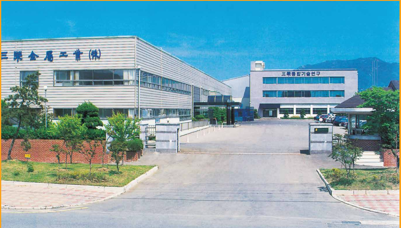
Main plant 본사 공장