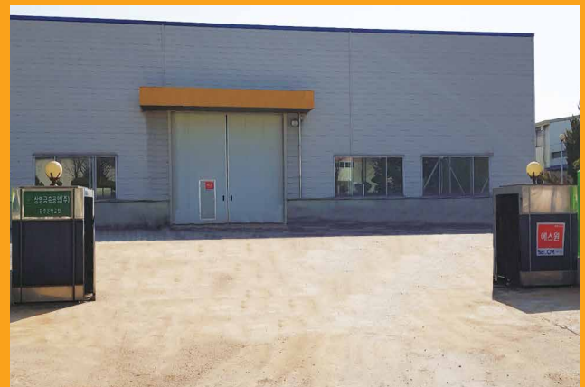
3rd Factory(Near SEOUL)

SAMYUNG is the manufacturer of steering and suspension auto parts in Korea.